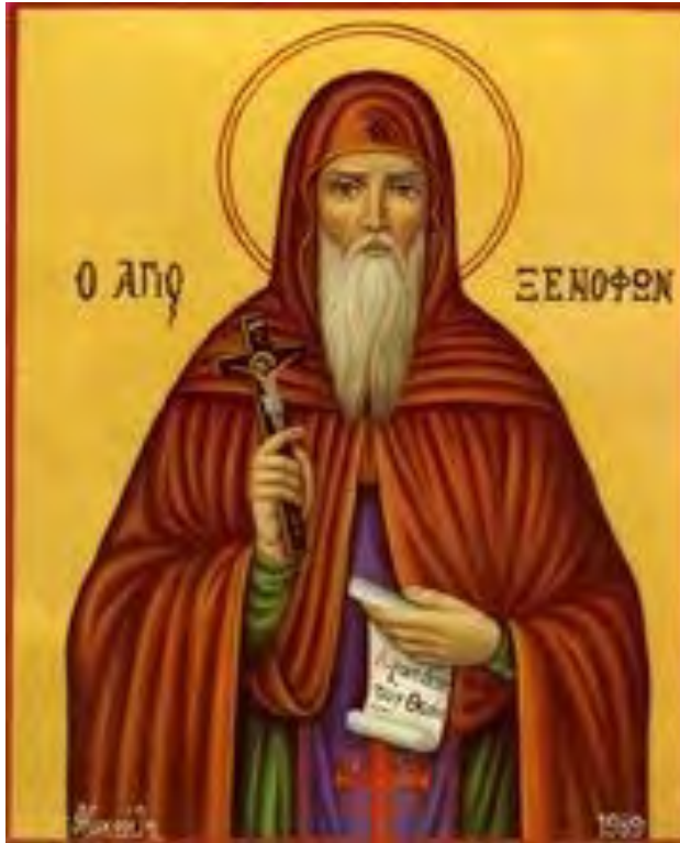
Saint Xenophon ✠ Ο Άγιος Ξενοφών